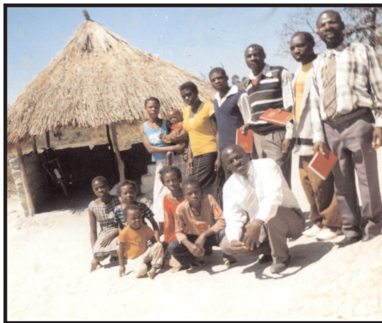
New Church - Kandemba Church of Christ